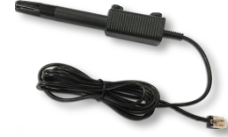
USB WIFI Dongle